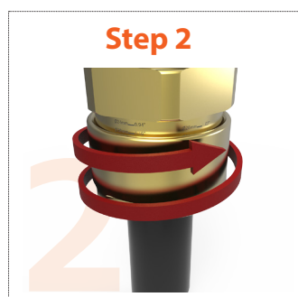
Step 2 Tighten backnut until a seal is formed onto the cable, then tighten one further turn