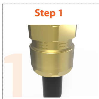
Step 1 Follow cable gland installation instructions until final stage – tightening of rear seal

The gland is permanently marked with various lines/numbers indicating the correct tightening level related to the cable diameter. Following the relevant cable gland Installation Instructions, the back seal should be tightened until a seal is formed on the cable outer sheath and then tightened one further turn.