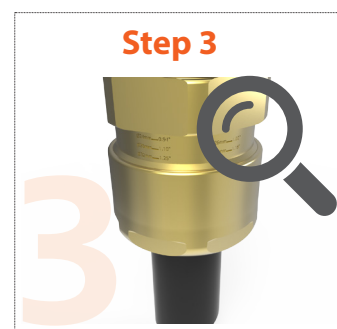
Step 3 The backnut should be level with the marking guide corresponding to its diameter – this can be visually inspected and adjusted as necessary

Note: The cable gland installation instructions have a printed cable OD measure for if the cable OD is not known